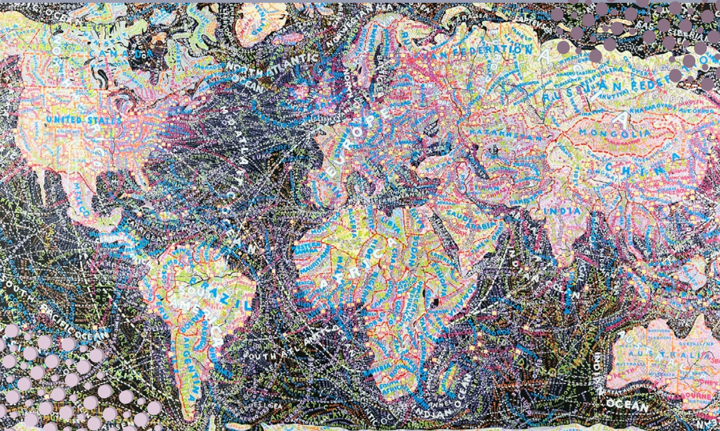
World Trade, Acrilic Paint. 2010