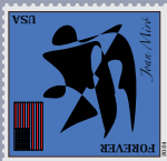
The United States (Blue), Acrylic Paint. 2007