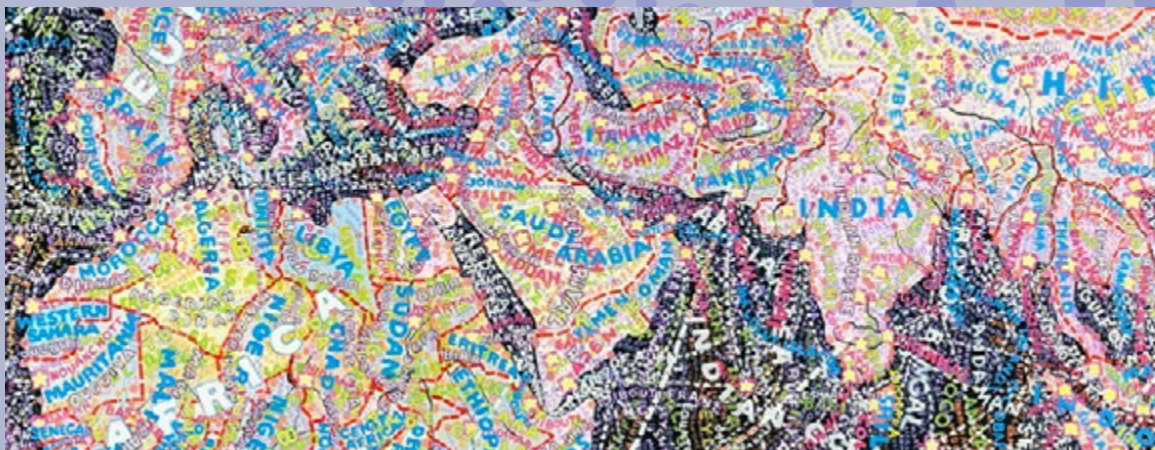
World Trade Routes Acrilic Paint. 2010