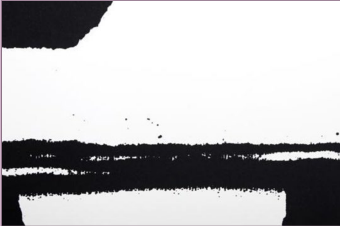
The Letter G ( detail ), Graphic. 1994