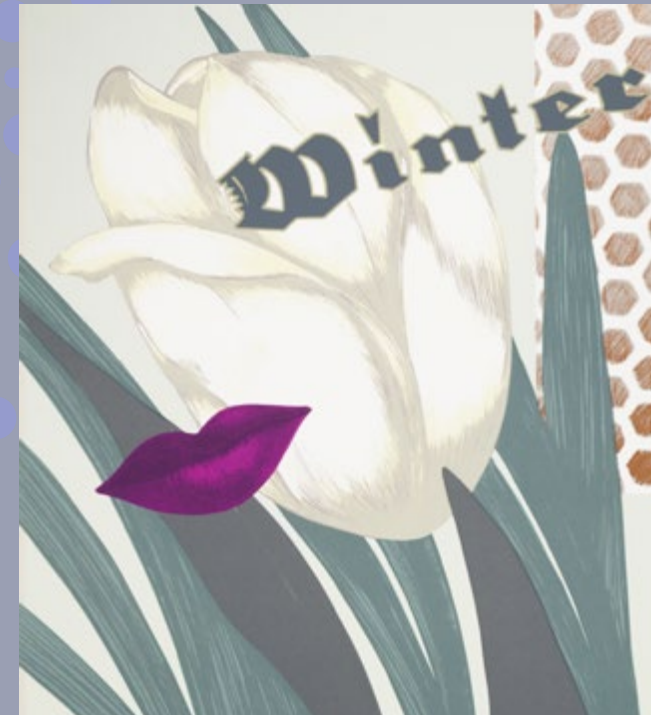
Winter, Screenprints in Colors 1987