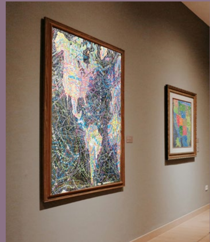
Euorpe Trades Routes and Untied States Counties