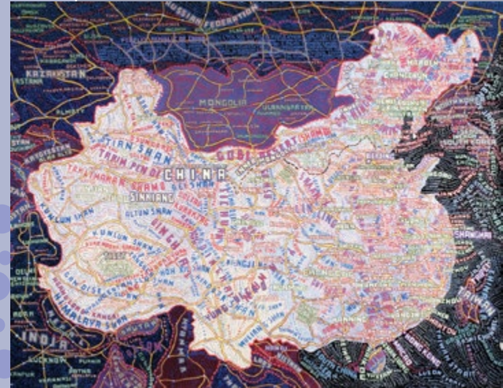
China, Acrilic Paint. 2008